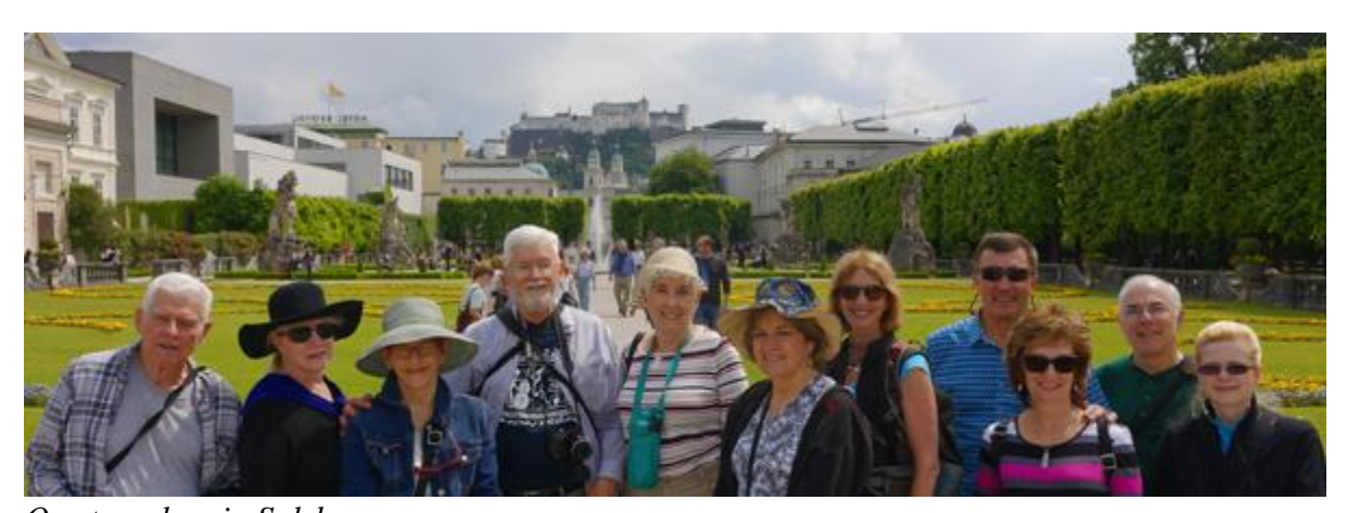
Our travelers in Salzburg.