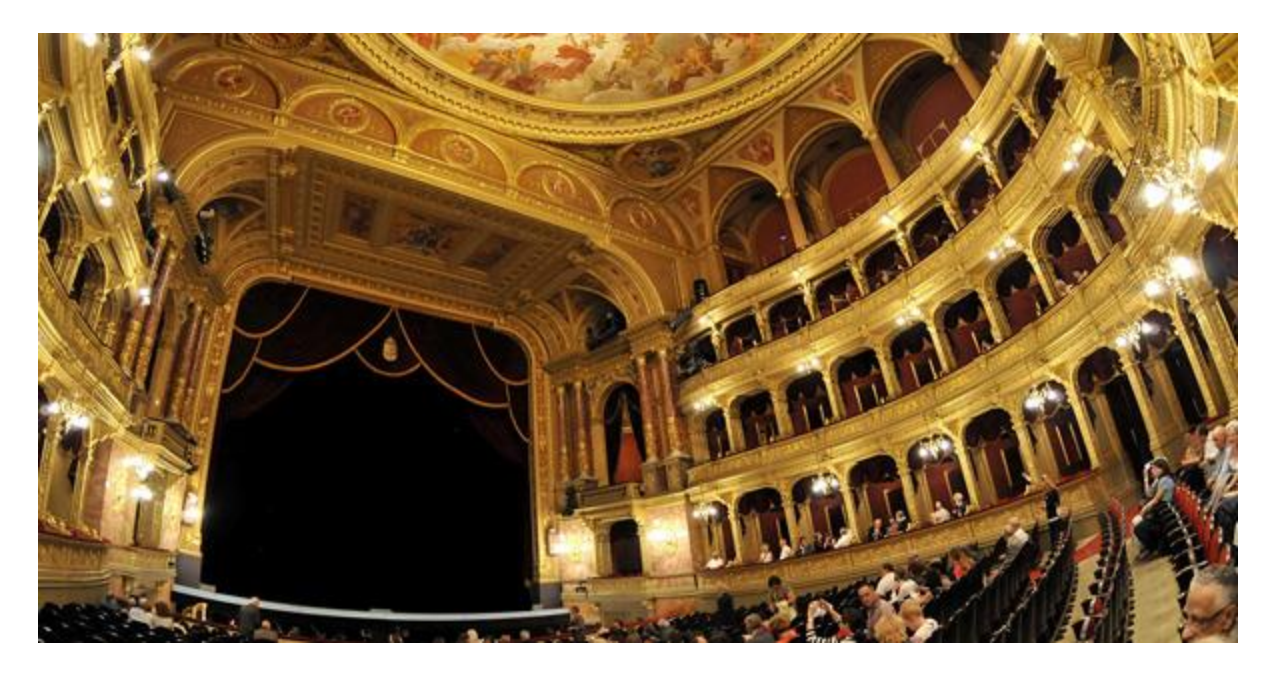
The opulent Budapest State Opera House.