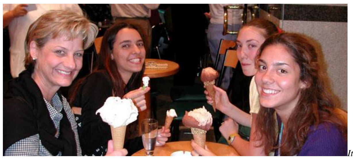
would be impolite not to enjoy the sweets, cakes, and ice cream during the trip.